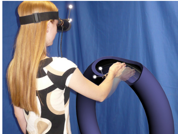
Figure 2. The HEMP - Hand-Displacement-Based Pseudo-Haptics experiment.

In the continuation of the work on pseudo-haptic (see [2]), in 2008, i3D proposed HEMP - Hand-Displacement-Based Pseudo-Haptics, a new pseudo-haptic concept based on a visuo-proprioceptive conflict. Thanks to video see-through HMDs, one can perturb the position of the visual feedback of a body part (for instance the hand) and create a visuo-proprioceptive conflict. The purpose of this work was to study this conflict and to check whether it could be exploited to provide haptic sensations. The study has been conducted in the context of force-field simulation (see 2). Several experiments have been conducted. Qualitative results demonstrate that some force sensations can be perceived by subjects. Quantitative evaluations confirm these results by showing that a yet limited number of force levels can be discriminated. This work has been published in the IEEE symposium on 3D User Interfaces and has been awarded the second best paper award (see [15]).