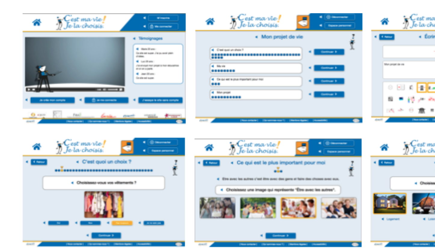
Figure 2. Sample screenshots from the Life Plan website.