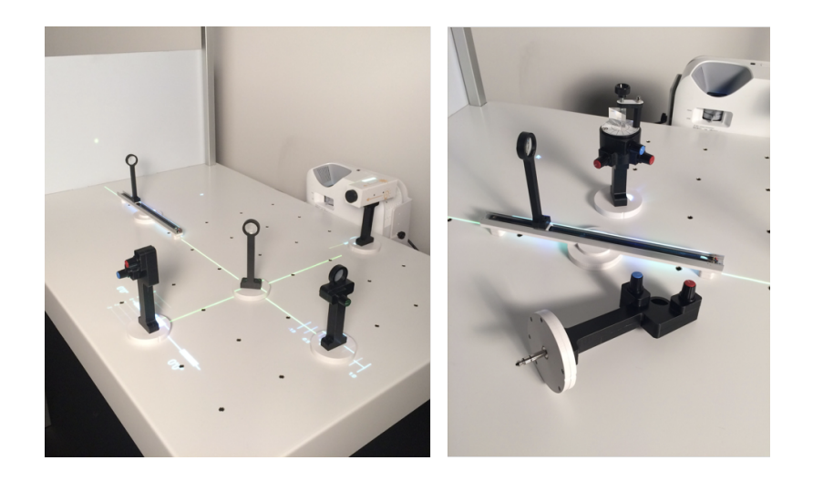
Figure 3. The new version of HOBIT. Users can easily plug fake optical components (e.g. source lights, mirrors and lens) anywhere on the table to build their optical experiment.

In 2018, we have continued working on the HOBIT platform dedicated to teaching and training of Optics at University. We have notably improved the hardware side, as illustrated in Figure 3.