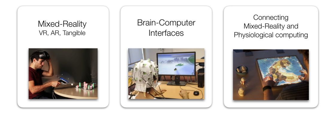
Figure 2. Main research axes of Potioc.

Finally, in the transverse axis, we explore new approaches that involve both mixed-reality and neurophysiological signals. In particular, tangible and augmented objects allow us to explore interactive physical visualizations of human inner states. Physiological signals also enable us to better assess user interaction, and consequently, to refine the proposed interaction techniques and metaphors.