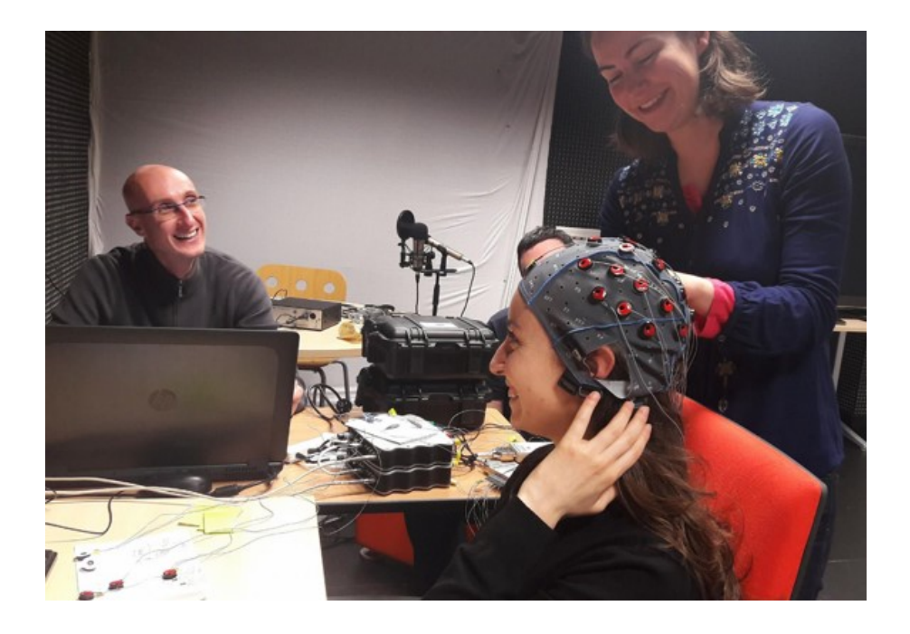
Figure 8. An EEG cap is being placed on the head of a subject by an experimenter on the right while another experimenter on the left is setting up the necessary software on the computer.

The Influence of the experimenter: Through out the research and development process of MI-BCI, human supervision (e.g., experimenters or caregivers) plays a central role. People need to present the technology to users and ensure the smooth progress of the BCI learning and use. Though, very little is known about the influence they might have on their results. Such influence is to be expected as social and emotional feedback were shown to influence MI-BCI performances and user experience. Furthermore, literature from different fields indicate an effect of experimenters, and specifically their gender, on experiment outcome. Therefore, we assessed the impact of gender on MI-BCI performances, progress and user experience. An interaction of the runs, subjects gender and experimenters gender was found to have an impact on the performances of the subjects, suggesting users learn better with female experiments [30] (see Fig. 8).