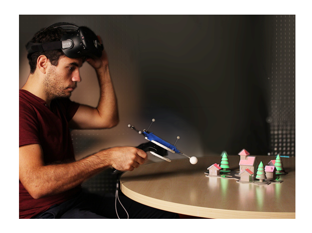
Figure 4. A user experiencing transitions between spatial augmented reality and virtual reality spaces.