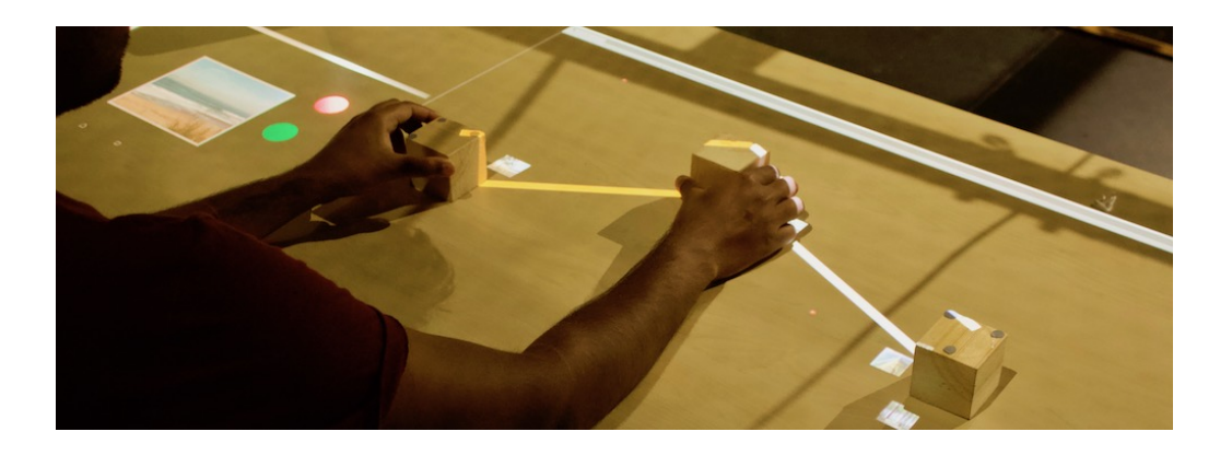
Figure 5. Tangible and augmented objects to foster collaborative learning at school.

We have also pursued our work on collaborative learning at school, part of the e-Tac project. In particular, based on focus group with children and practitioners, we have refined our interactive pedagogical environment, and we have implemented a new version (see Figure 5) [53]