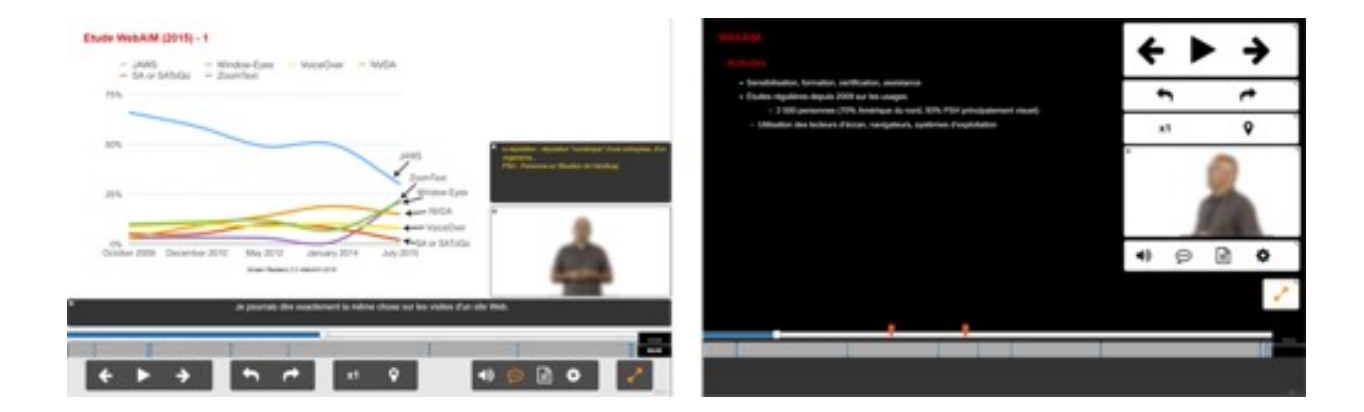
Figure 7. The Aïana MOOC player.

Exploring Modern Machine Learning Methods to Estimate Mental Workload From EEG Signals: Estimating mental workload from brain signals such as EEG has proven very promising in multiple HCI applications, e.g., to design games or educational applications with adaptive difficulty. However, currently obtained workload classification accuracies are relatively low, making the resulting estimations not fully trustable. We thus studied promising modern machine learning algorithms, including Riemannian geometry-based methods and Convolutional Neural Networks, to estimate workload from EEG signals. We studied them with both user-specific and user-independent calibration, to go towards calibration-free systems. Our results suggested that a shallow Convolutional Neural Network obtained the best performance in both conditions, outperforming state-of-the-art methods on the used data sets. This work was published as a work-in-progress in the CHI conference [19].