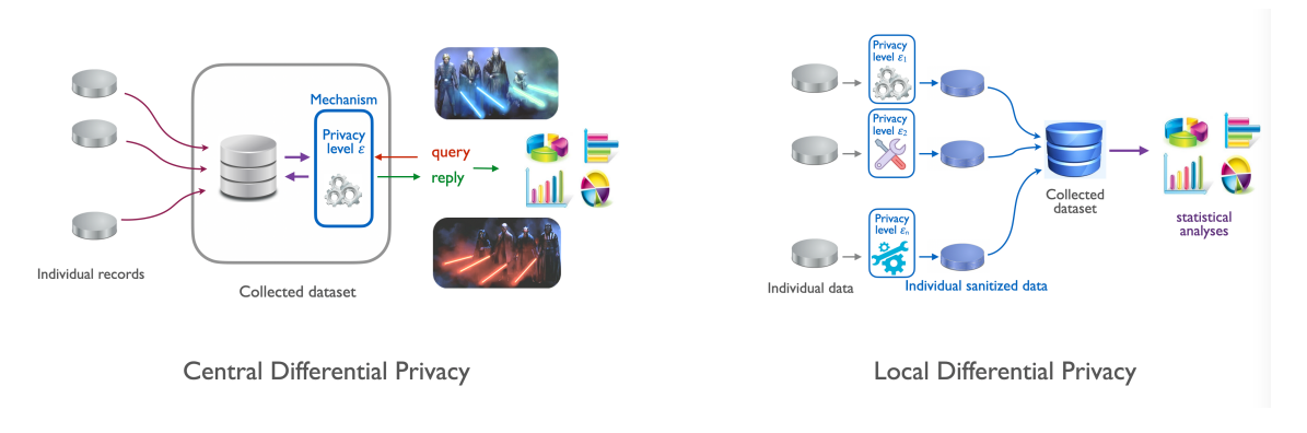
Figure 1: The central and the local models of differential privacy