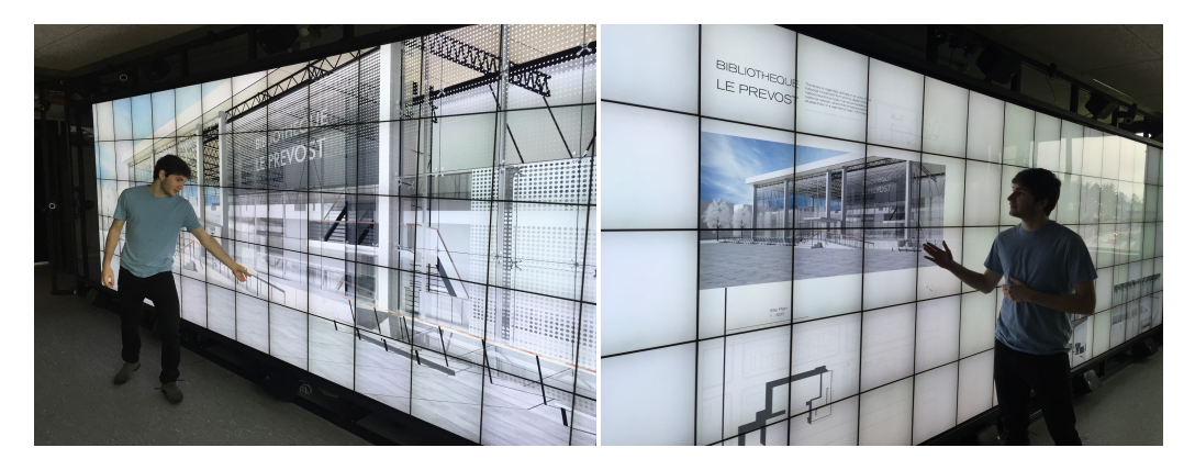
Figure 1: The WILDER platform.

In addition to using WILD and WILDER for our research, we have also developed software architectures and toolkits, such as WildOS and Unity Cluster, that enable developers to run applications on these multi-device, cluster-based systems.