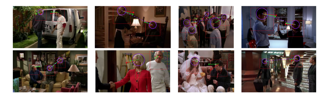
Figure 2: This figure shows some examples of eye-gaze detection and tracking obtained with the method proposed in [98]. The algorithm infers both eye-gaze (green arrows) and visual focus of attention (blue circles) from head-gaze [64] (red arrows). A side-effect of this inference is the detection of people looking at each other (dashed blue line).

facial expression recognition, etc. Nevertheless, deep neural networks still have difficulties in capturing motion information directly from image sequences. For example, human activity detection, tracking and recognition use pre-computed optical flow to compute motion information. Most of the work has focused on HBU at a single person level and less effort has been devoted into developing deep learning methods for studying group activities and behavior, in particular in the context of interaction.