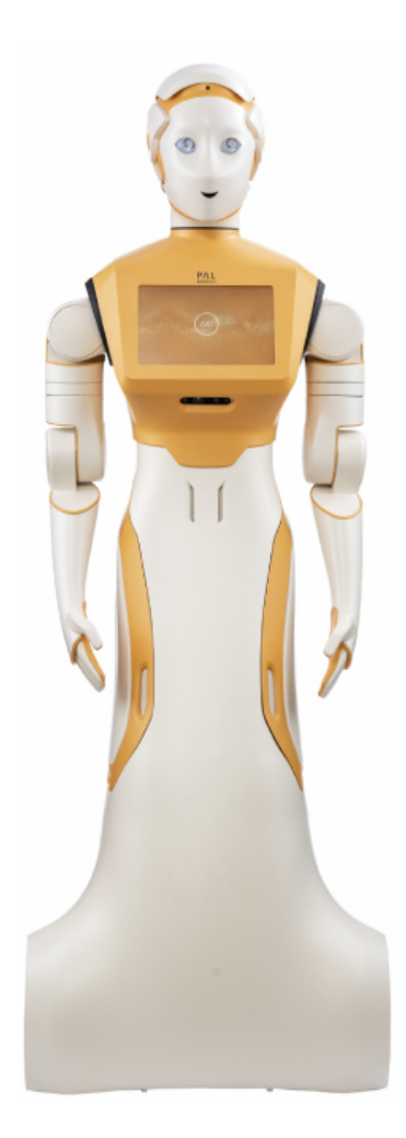
Figure 3: The ARI robot from PAL Robotics.