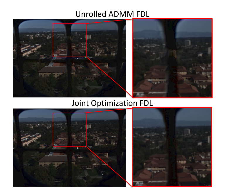
Figure 1: View reconstructed with the unrolled FDL method (top) and with the joint unrolled and view synthesis method (bottom).

We have addressed the problem of capturing a light field using a single traditional camera, by solving the inverse problem of dense light field reconstruction from a focal stack containing only very few images captured at different focus distances. An end-to-end joint optimization framework has been designed, where a novel unrolled optimization method is jointly optimized with a view synthesis deep neural network. The proposed unrolled optimization method constructs Fourier Disparity Layers (FDL), a compact representation of light fields which samples Lambertian non-occluded scenes in the depth dimension and from which all the light field viewpoints can be computed [24]. Solving the optimization problem in the FDL domain allows us to derive a closed-form expression of the data-fit term of the inverse problem. Furthermore, unrolling the FDL optimization allows us to learn a prior directly in the FDL domain [8]. In order to widen the FDL representation to more complex scenes, a Deep Convolutional Neural Network (DCNN) is trained to synthesize novel views from the optimized FDL. We show that this joint optimization framework reduces occlusion issues of the FDL model (see Figure 1 below), and outperforms recent state-of-the-art methods for light field reconstruction from focal stack measurements.