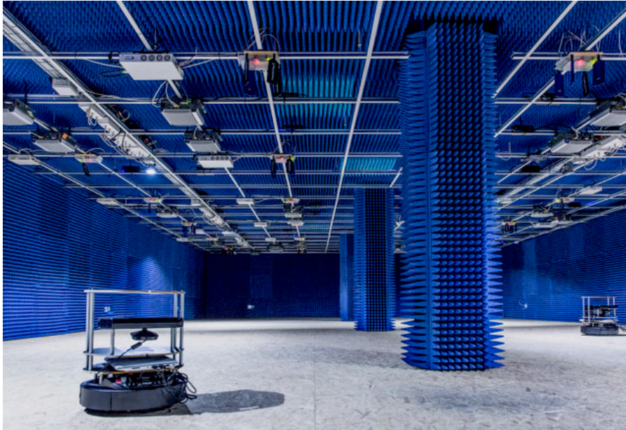
Figure 3: FIT/CorteXlab facility

Free Description: A dataset of recorded RF signals, labeled by the identifier of the radio device that emitted the signal. The signals are raw IQ samples recorded with a USRP in the CorteXlab platform. The dataset contains a set of different transmission scenarios, with various signal types, and emission conditions, none of which contain explicit identifying signals. Its intended use is to train and/or test algorithms for RF fingerprinting, identification of the transmitter of a signal, solely based on the RF signature imposed by the transmitter's electronic components. The dataset is used and described in details in [22].