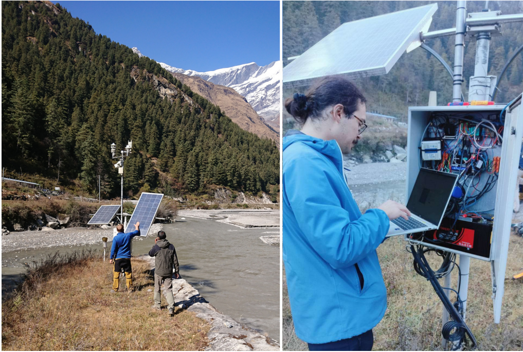
Figure 2: LivingFog installation in Lete, Nepal.

fog applications. Second, the runtimes should support reducing the energy consumption of the underlying infrastructure, particularly important for resource-constrained fog nodes. A major limitation of current FaaS runtimes is their lack of support for meeting latency and energy consumption requirements.