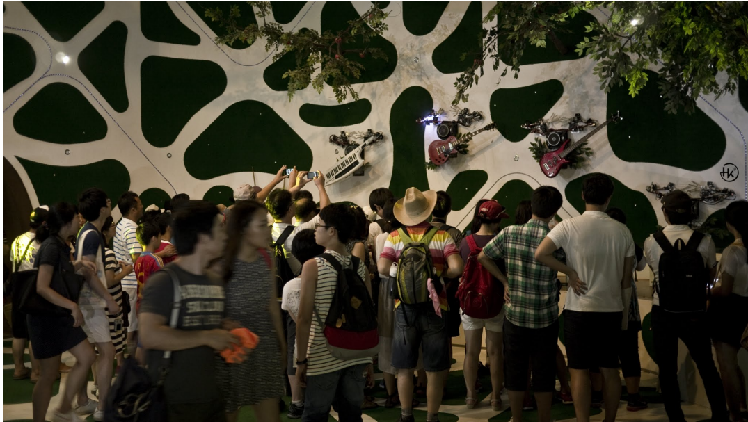
Figure 32. Exhibited musician robots on the wall of the french ward