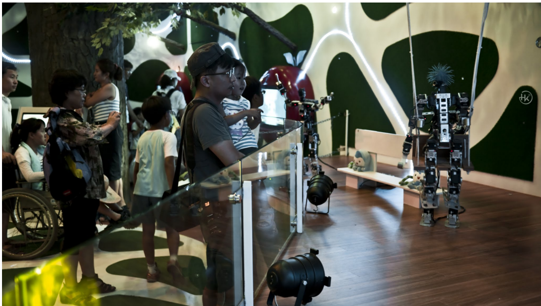
Figure 33. Exhibited humanoid robots on the wall of the french ward