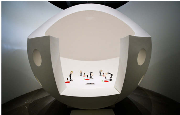
Figure 30. The Ergo-Robot experiment: robot learning experiment running continuously for 5 months at Fondation Cartier pour l'Art Contemporain, exhibition "Mathématiques: Un Dépaysement Soudain".

More information available at: http://flowers.inria.fr/ergo-robots.php and http://fondation.cartier.com/ .