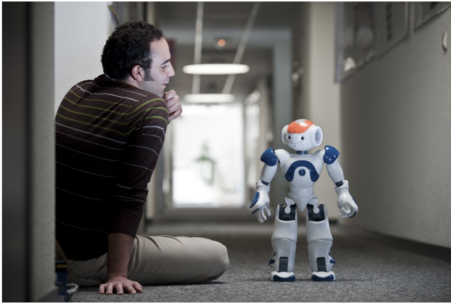
Figure 1. Audio-visual interaction between a person and the humanoid robot NAO developed under the HUMAVIPS project.