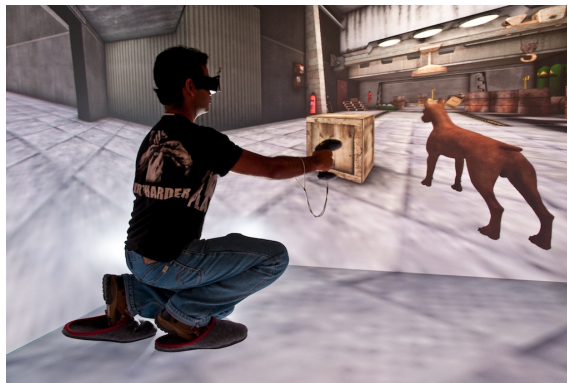
Figure 13. A person immersed in a virtual environment where the behaviors of several dogs will evoke different levels of anxiety.

ARC NIEVE has resulted in several publications this year: [21], [13].