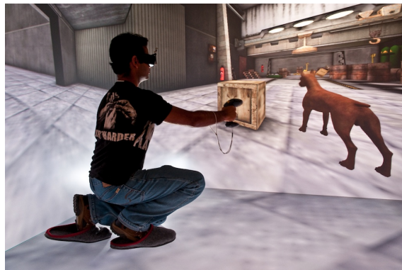
Figure 13. A person immersed in a virtual environment where the behaviors of several dogs will evoke different levels of anxiety.

ARC NIEVE has resulted in several publications this year: [21], [13].