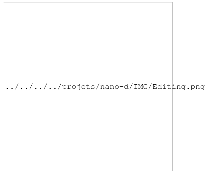
Figure 2. Different steps to prototype a “nano-pillow” with the adaptive interactive modeler.

We have recently shown that our incremental and adaptive algorithms allow us to easily edit and model complex shapes, such as a nanotube (Fig. 1) and the “nano-pillow” below (Fig. 2).