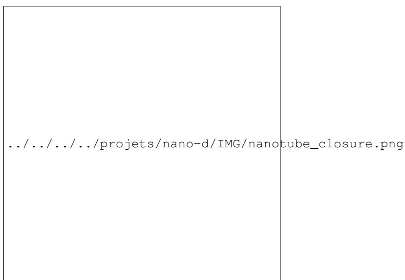
Figure 1. Snapshots of a nanotube capping process with the adaptive interactive modeler. Thanks to the adaptive methodology, this operation can be done in a few minutes.

The magazine Science has recently featured a paper demonstrating an example of DNA nanotechnology, where DNA strands are stacked together through programmable self-assembly. In February 2007, the cover of Nature Nanotechnology showed a “nano-wheel” composed of a few atoms only. Several nanosystems have already been demonstrated, including a wheelbarrow molecule, a nano-car and a Morse molecule, etc. Typically, these nanosystems are designed in part via quantum mechanics calculations, such as the semi-empirical ASED+ calculation technique.