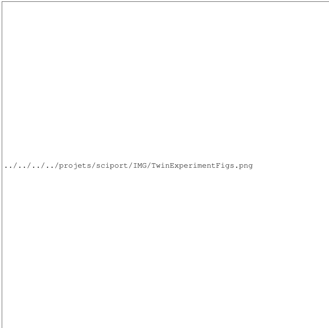
Figure 1. Twin experiment using the adjoint of OPA. We add random noise to a simulation of the ocean state around the Antarctic, and we remove this noise by minimizing the discrepancy with the physical model