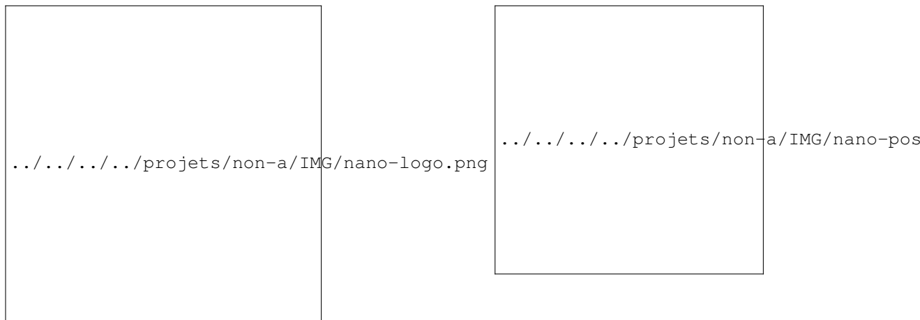
Figure 3. Left: A machined nano structure: 16\mu\text{m} \times 8\mu\text{m} \times \text{some nm} . Right: Nano-positioning system available at Arts et Métiers ParisTech Lille ( 75\mu\text{m} range of motion).

Recent research investigations have reported the development of a number of process chains that are complementary to those used for batch manufacturing of Micro Electro Mechanical Systems (MEMS) and, at the same time, broaden the application domain of products incorporating micro and nano scale features. Such alternative process chains combine micro and nano structuring technologies for master making with replication techniques for high volume production such as injection moulding and roll-to-roll imprinting. In association with the Manufacturing Engineering Center of Cardiff, Arts et Metiers ParisTech center of Lille develops a new process chain for the fabrication of components with nano scale features. In particular, AFM probe-based nano mechanical machining is employed as an alternative master making technology to commonly used lithography-based processes (Fig. 3 ). Previous experimental studies demonstrated the potential of this approach for thermoplastic materials. Such a manufacturing route also represents an attractive prototyping solution to test the functionalities of components with nano scale features prior to their mass fabrication and, thus, to reduce the development time and cost of nano technology-enabled products. Application of our control and estimation techniques improves the trajectory tracking accuracy and the speed of the machining tools.