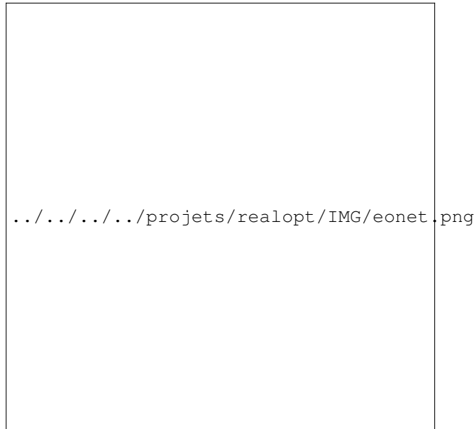
Figure 1. Design of a SDH/SONET european network where demands are multiplexed.