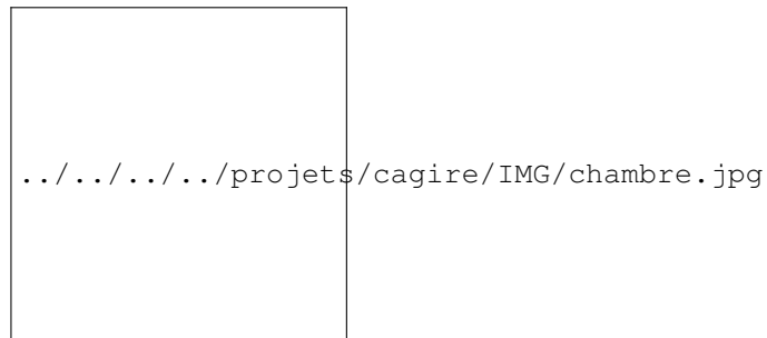
Figure 2. Effusion cooling of aeronautical combustion chambers: close view of a typical perforated chamber wall

Effusion cooling is nowadays very widespread, especially in the aeronautical context. It consists in piercing holes on the wall of the combustion chamber. These holes induce cold jets that enter inside the combustion chamber. The goal of this jet is to form a film of air that will cool the walls of the chamber, see Figure 2 .