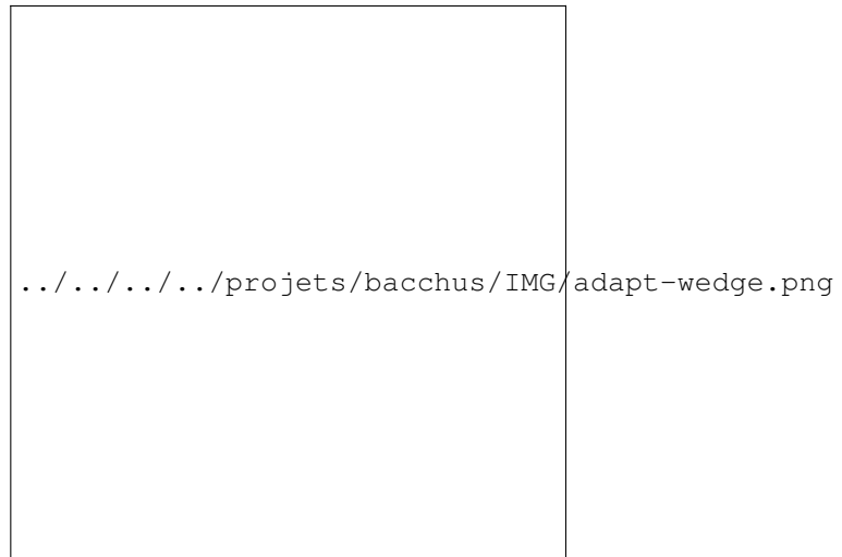
Figure 1. Adapted mesh for a viscous flow over a triangular wedge.