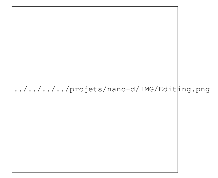
Figure 2. Different steps to prototype a "nano-pillow" with the adaptive interactive modeler.

We have recently shown that our incremental and adaptive algorithms allow us to easily edit and model complex shapes, such as a nanotube (Fig. 1) and the "nano-pillow" below (Fig. 2).