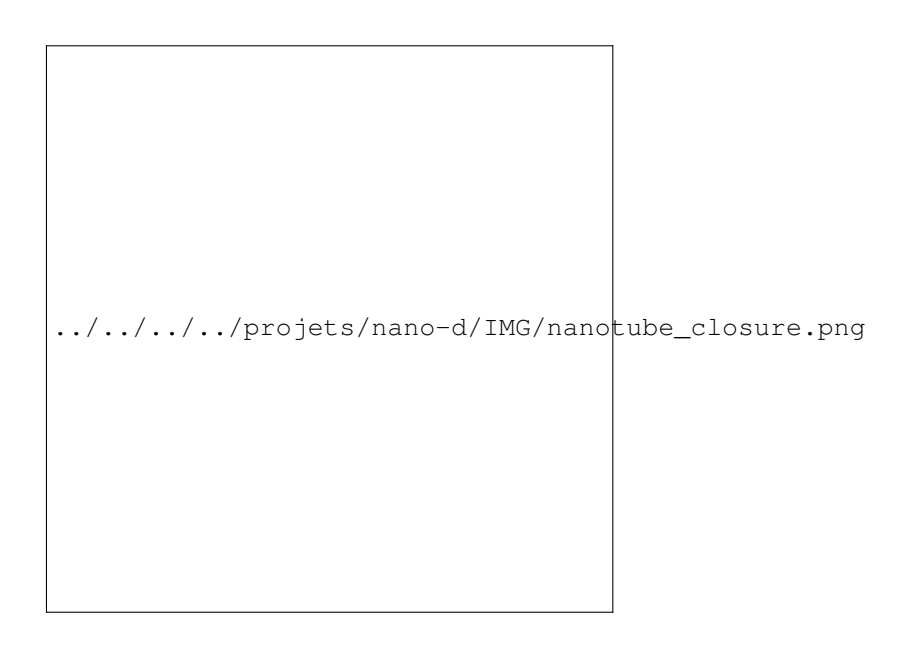
Figure 1. Snapshots of a nanotube capping process with the adaptive interactive modeler. Thanks to the adaptive methodology, this operation can be done in a few minutes.

The magazine Science has recently featured a paper demonstrating an example of DNA nanotechnology, where DNA strands are stacked together through programmable self-assembly. In February 2007, the cover of Nature Nanotechnology showed a "nano-wheel" composed of a few atoms only. Several nanosystems have already been demonstrated, including a wheelbarrow molecule, a nano-car and a Morse molecule, etc. Typically, these nanosystems are designed in part via quantum mechanics calculations, such as the semi-empirical ASED+ calculation technique.