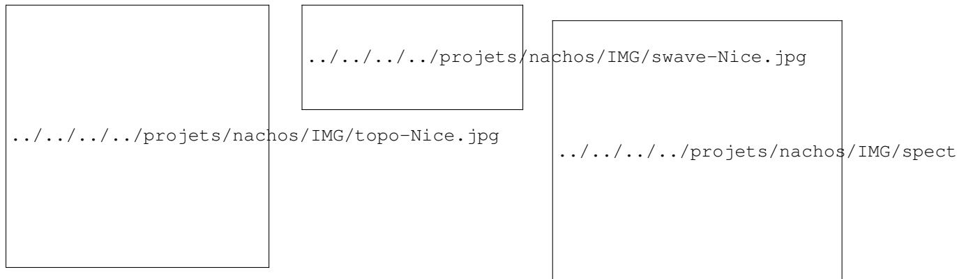
Figure 3. Propagation of a plane wave in a heterogeneous model of Nice area (provided by CETE Méditerranée). Left figure: topography of Nice and location of the cross-section used for numerical simulations (black line). Middle figure: S-wave velocity distribution along the cross-section in the Nice basin. Right figure: transfer functions (amplification) for a vertically incident plane wave ; receivers every 5 m at the surface. This numerical simulation was performed using a numerical method for the solution of the elastodynamics equations coupled to a Generalized Maxwell Body (GMB) model of viscoelasticity (PhD thesis of Fabien Peyrusse).