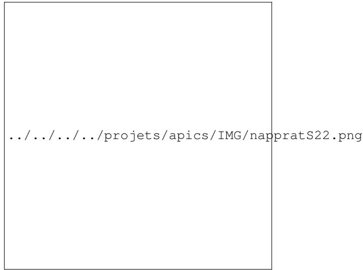
Figure 2. Nyquist Diagram. Rational approximation (degree 8) and data - S_{22} .

The team also investigates problems relative to the design of optimal responses for microwave devices. The resolution of a quasi-convex Zolotarev problems was for example proposed, in order to derive guaranteed optimal multi-band filter's responses subject to modulus constraints [10]. This generalizes the classical single band design techniques based on Chebyshev polynomials and elliptic functions. These techniques rely on the fact that the modulus of the scattering parameters of a filters, say |S_{1,2}| , admits a simple expression in terms of the filtering function D = |S_{1,1}|/|S_{1,2}| namely,