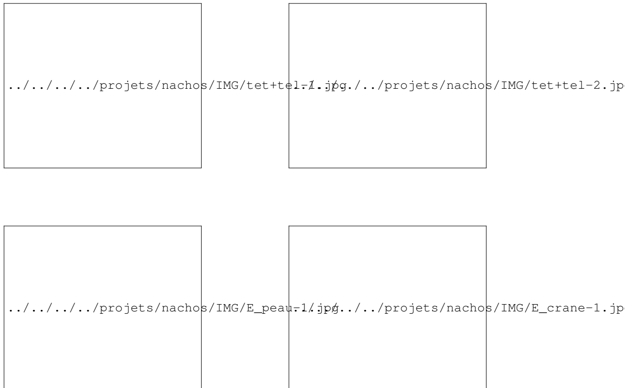
Figure 1. Exposure of head tissues to an electromagnetic wave emitted by a localized source. Top figures: surface triangulations of the skin and the skull. Bottom figures: contour lines of the amplitude of the electric field.