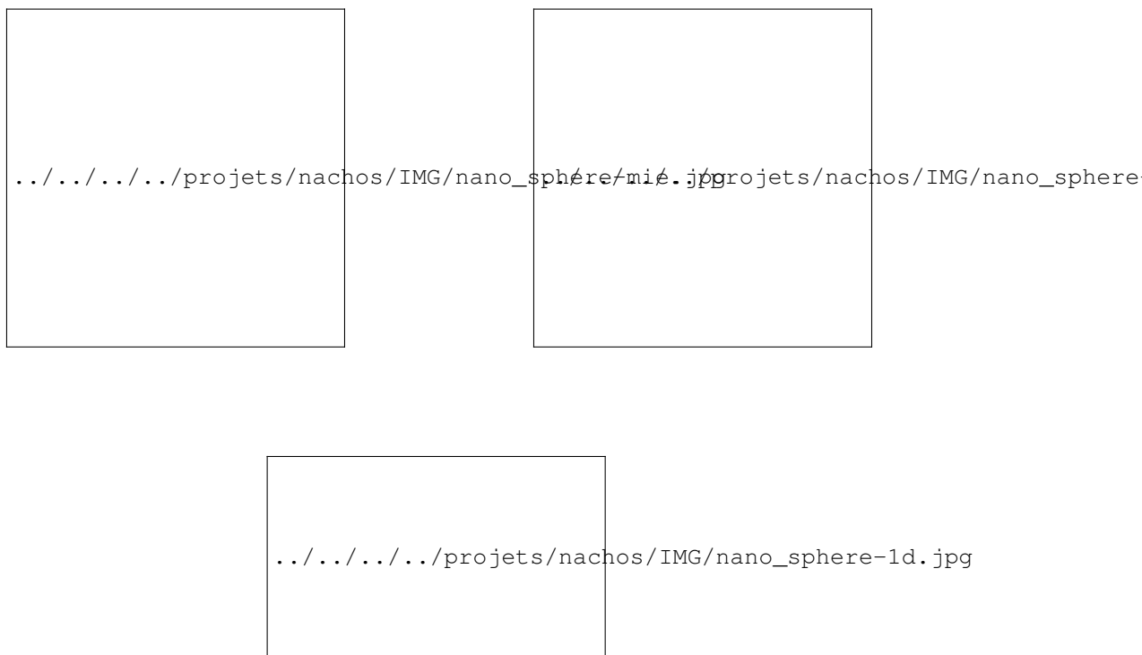
Figure 2. Scattering of a 20 nanometer radius gold nanosphere by a plane wave. The gold properties are described by a Drude dispersion model. Modulus of the electric field in the frequency domain. Top left figure: Mie solution. Top right figure: numerical solution. Bottom figure: 1D plot of the electric field modulus for various orders of approximation (PhD thesis of Jonathan Viquerat).