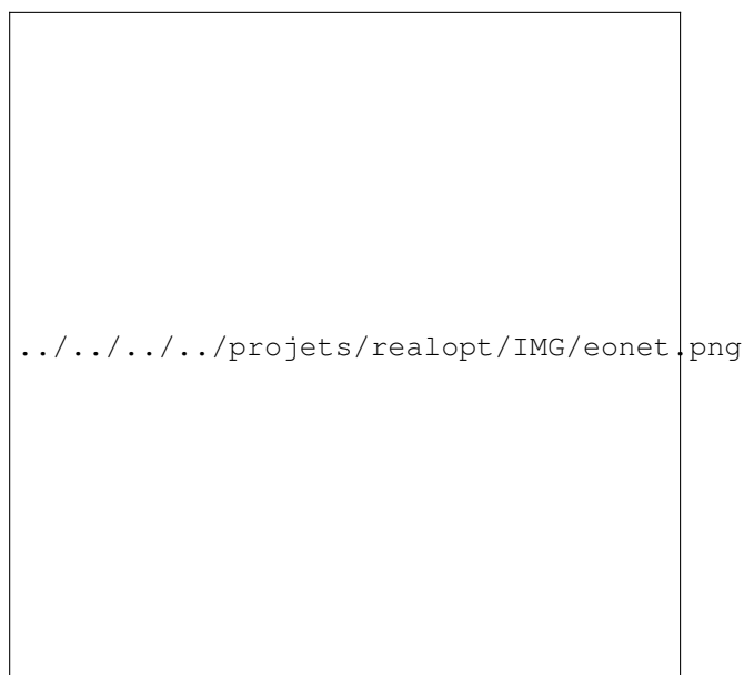
Figure 1. Design of a SDH/SONET european network where demands are multiplexed.