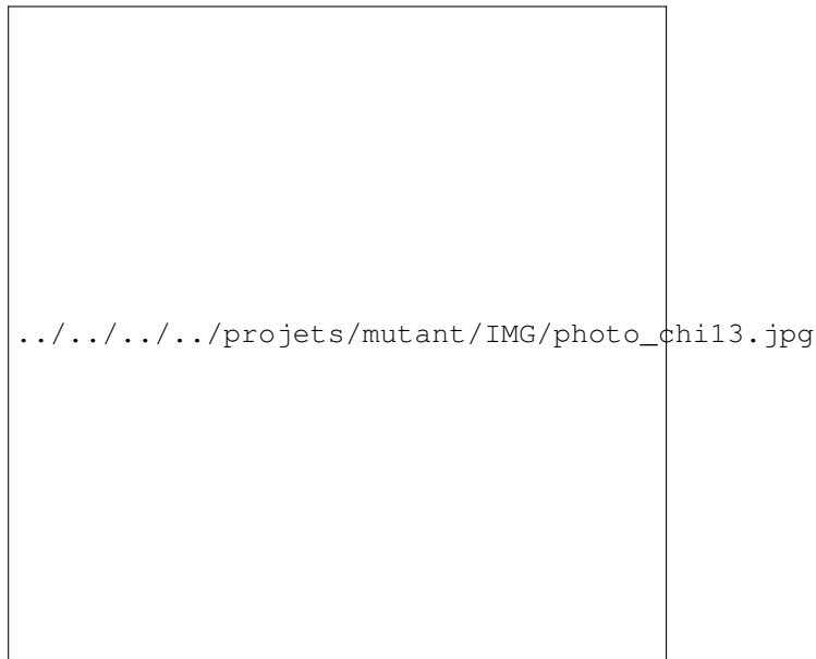
Figure 4. Automatic Accompaniment Session with Antescofo during ACM CHI 2013 Conference

Technologies developed by MuTant can find their way with general public (besides professional musicians) and within the entertainment industry. Recent trends in music industry show signs of tendencies towards more intelligent and interactive interfaces for music applications. Among them is reactive and adaptive automatic accompaniment and performance assessment as commercialized by companies such as MakeMusic and Tonara . Technologies developed around Antescofo can enhance interaction between user and the computer for such large public applications. We hope to pursue this by licensing our technologies to third-party companies.