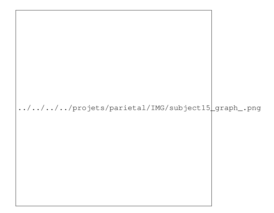
Figure 2. Example of functional connectivity analysis: The correlation matrix describing brain functional connectivity in a post-stroke patient (lesion outlined in green) is compared to a group of control subjects. Some edges of the graphical model show a significant difference, but the statistical detection of the difference requires a sophisticated statistical framework for the comparison of graphical models.