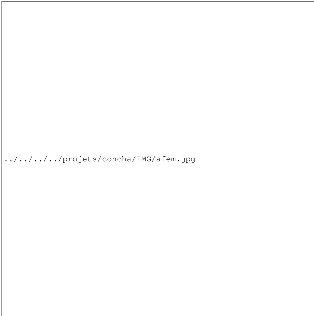
Figure 2. Solution with rough right-hand-side in a corner domain and adaptively refined mesh (from [45]).