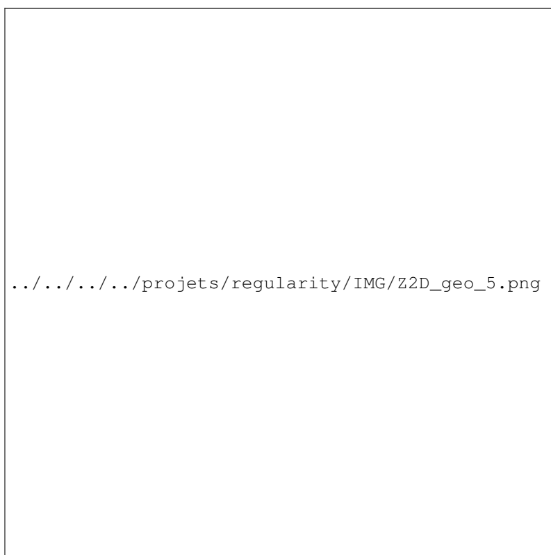
Figure 1. Self-regulating multifractional process with g(x) = 1 - x^2