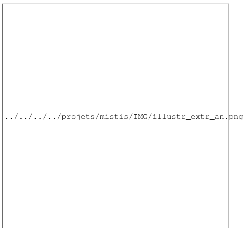
Figure 1. The curve represents the survival function x \rightarrow P(X > x) . The 1/n -quantile is estimated by the maximum observation so that \hat{x}_{1/n} = X_{n,n} . As illustrated in the figure, to estimate p_n -quantiles with p_n < 1/n , it is necessary to extrapolate beyond the maximum observation.