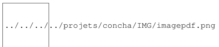
Figure 5. An example of a pdf file