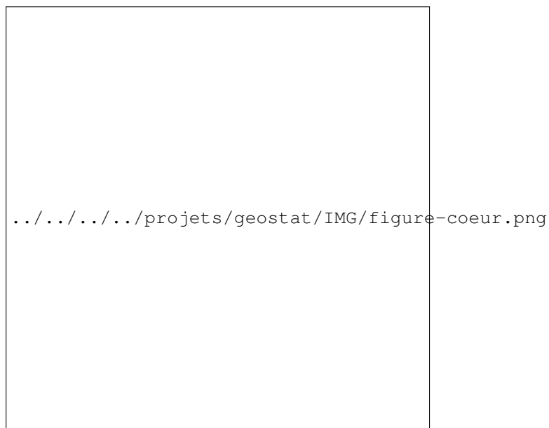
Figure 2. Result of the computation of a normalized source field over the 3D epicardial surface of the atria, from electric potential data acquired on a regular grid of electrodes placed on a patient's chest. There is a strong correlation between the red parts of the source field and the locations inside the heart where fibrillation occurs. Inputted data courtesy of IHU LIRYC.