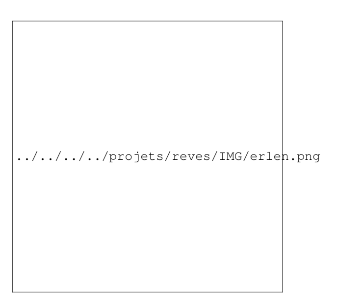
Figure 1. Plausible rendering of an outdoors scene containing points, lines and polygons [22], representing a scene with trees, grass and flowers. We can achieve 7-8 frames per second compared to tens of seconds per image using standard polygonal rendering.

Similar to image rendering, plausible approaches can be designed for audio rendering. For instance, the complexity of rendering high order reflections of sound waves makes current geometrical approaches inappropriate. However, such high order reflections drive our auditory perception of "reverberation" in a virtual environment and are thus a key aspect of a plausible audio rendering approach. In complex environments, such as cities, with a high geometrical complexity, hundreds or thousands of pedestrians and vehicles, the acoustic field is extremely rich. Here again, current geometrical approaches cannot be used due to the overwhelming number of sound sources to process. We study approaches for statistical modeling of sound scenes to efficiently deal with such complex environments. We also study perceptual approaches to audio rendering which can result in high efficiency rendering algorithms while preserving visual-auditory consistency if required.