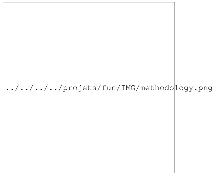
Figure 2. Methodology applied in the FUN research group.

In order to achieve this experimental environments, the FUN research group will maintain its strong activity on platform deployment such as SensLAB [63], FIT and Aspire [53]. Next steps will be to experiment not only on testbeds but also on real use cases. These latter will be given through different collaborations.