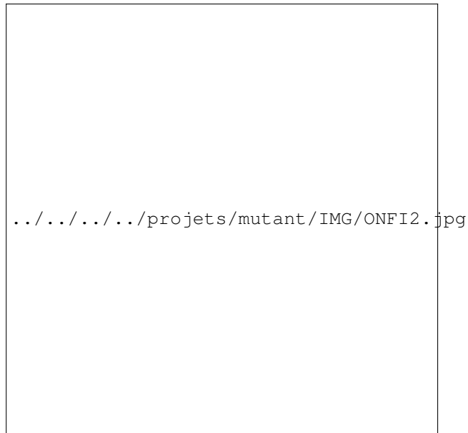
Figure 2. Antescofo presentation and demo in Bercy, Ministry of Industry.

Antescofo has been awarded the Industry prize by the French Minister of Industry, for its R&D and upcoming industrial applications.