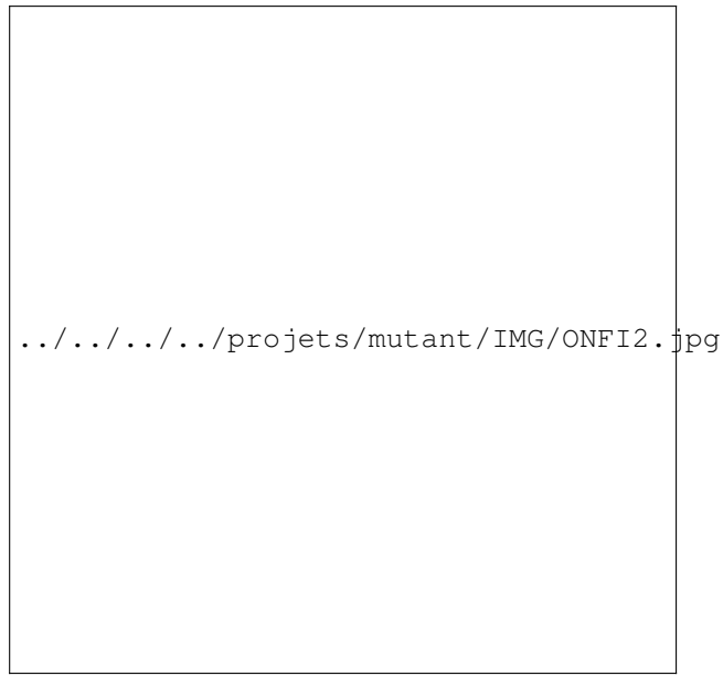
Figure 2. Antescofo presentation and demo in Bercy, Ministry of Industry.

Antescofo has been awarded the Industry prize by the French Minister of Industry, for its R&D and upcoming industrial applications.