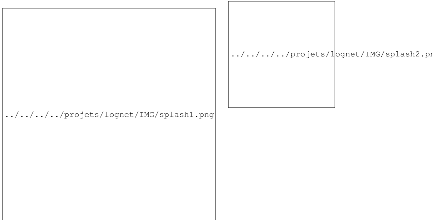
Figure 2. http://www.mymed.fr