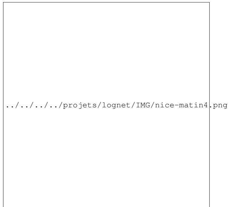
Figure 3. Nice Matin