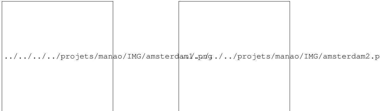
Figure 3. The installation “The Revealing Flashlight” lets visitors explore ancient artifacts interactively.

The third highlight is shared with our partners of the ANR SeARCH project (see Section 7.2.1 ). The results of our collaborative work on the Isis statue was one of the key events of a 6 months exhibition at the “Musée Royal de Mariemont” in Brussels. We also had a major success with our interactive installation “The Revealing Flashlight” (cf. Figure 3 ). These results were made possible by the new visualization and re-assembly tools developed in our team.