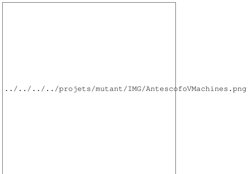
Figure 5. General scheme of Antescofo virtual machine

Antescofo is a modular polyphonic Score Following system as well as a Synchronous Programming language for musical composition. The module allows for automatic recognition of music score position and tempo from a realtime audio Stream coming from performer(s), making it possible to synchronize an instrumental performance with computer realized elements. The synchronous language within Antescofo allows flexible writing of time and interaction in computer music.