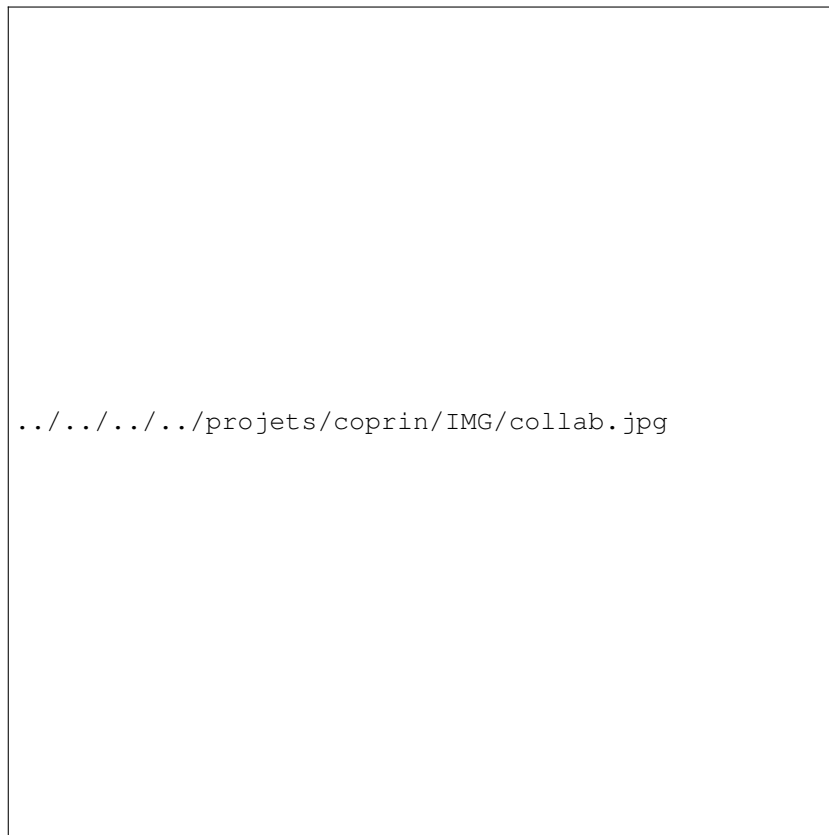
Figure 1. COPRIN collaboration. JP: joint project, JS: joint stay, Jphd: joint PhD students