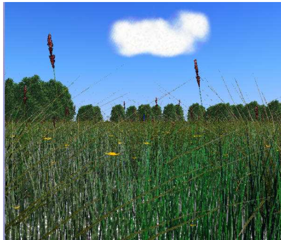
Figure 1. Plausible rendering of an outdoors scene containing points, lines and polygons [20], representing a scene with trees, grass and flowers. We can achieve 7-8 frames per second compared to tens of seconds per image using standard polygonal rendering.

Similar to image rendering, plausible approaches can be designed for audio rendering. For instance, the complexity of rendering high order reflections of sound waves makes current geometrical approaches inappropriate. However, such high order reflections drive our auditory perception of "reverberation" in a virtual environment and are thus a key aspect of a plausible audio rendering approach. In complex environments, such as cities, with a high geometrical complexity, hundreds or thousands of pedestrians and vehicles, the acoustic field is extremely rich. Here again, current geometrical approaches cannot be used due to the overwhelming number of sound sources to process. We study approaches for statistical modeling of sound scenes to efficiently deal with such complex environments. We also study perceptual approaches to audio rendering which can result in high efficiency rendering algorithms while preserving visual-auditory consistency if required.