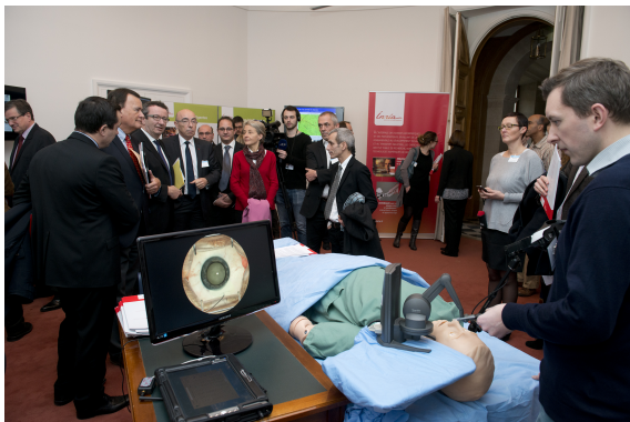
(a) Setup of our demo

Finally, a day dedicated to our software SOFA ("SOFA Day") was organized the day after the ISBMS conference. This was the opportunity to introduce SOFA to the ISBMS community and to share with the SOFA users.