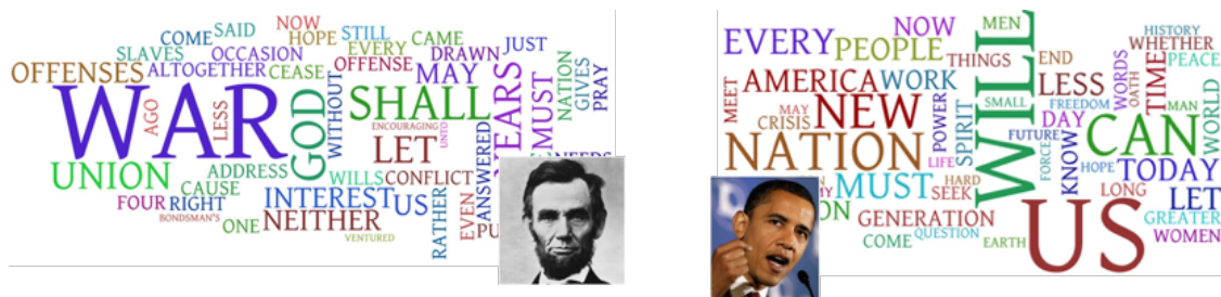
Figure 11. Examples of two histogram (bag-of-words) extracted from the congress speech of US president. In this application, the goal is to infer a meaningful metric on the words of the english language and lift this metric to histogram using OT technics.

We aim at developing novel variational estimators extending classification regression energies (SVM, logistic regression [129]) and kernel methods (see [173]). One of the key bottleneck is to design numerical schemes to learn an optimal metric for these purpose, extending the method of Marco Cuturi [113] to large scale and more general estimators. Our main targeted applications is natural language processing. The analysis and processing of large corpus of texts is becoming a key problems at the interface between linguistic and machine learning [50]. Extending classical machine learning methods to this field requires to design suitable metrics over both words and bag-of-words (i.e. histograms). Optimal transport is thus a natural candidate to bring innovative solutions to these problems. In a collaboration with Marco Cuturi (Kyoto University), we aim at unleashing the power of transportation distances by performing ground distance learning on large database of text. This requires to lift previous works on distance on words (see in particular [159]) to distances on bags-of-words using transport and metric learning.