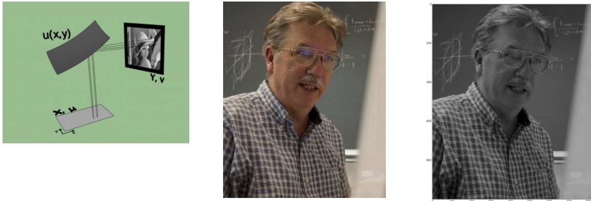
Figure 10. A constant source to a prescribed image (center). The reflector is computed (but not shown) and a resimulation using ray tracing shows the image reflected by the computed reflector.

See section 4.3 below for softwares. These method will clearly become mainstream in reflector design but also in lense design [168]. The industrial problems are mainly on efficiency (light pollution) and security (car head lights) based on free tailoring of the illumination. The figure below is an extreme test case where we exactly reproduce an image. They may represent one of the first incursion on PDE discretization based methods into the field of non-imaging optics.