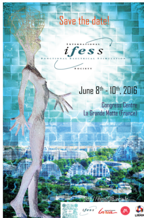
Figure 3. Flyer of IFESS 2016 conference

In 2016, CAMIN organized the 20th International Functional Electrical Stimulation Society Conference. 135 participants attended the event. Papers are referenced in Pubmed and published in European Journal of Translational Myology. A special issue with a selection of best articles will be published in 2017 in Artificial Organs Journal. http://ifess2016.inria.fr/