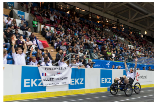
Figure 4. Freewheels team at Cybathlon 2016