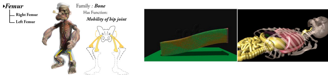
Figure 1. Left: My Corporis Fabrica is an anatomical knowledge database developed in our team. Right: SOFA is an open source simulator for physically based modeling.

My Corporis Fabrica (MyCF) is an anatomical knowledge ontology developed in our group. It relies on FMA (Foundational Model of Anatomy), developed under Creative Commons license (CC-by). MyCF browser is available on line, and is already in use for education and research in anatomy. Moreover, the MyCf's generic programming framework can be used for other domains, since the link it provides between semantic and 3D models matches several other research applications at IMAGINE.