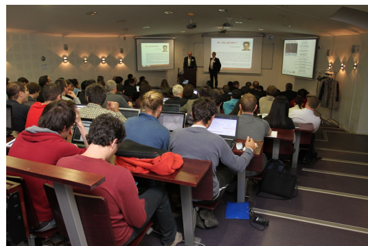
Figure 5. Photo of the FIT/CortexLab experimentation room installed and a snapshot of the inauguration meeting