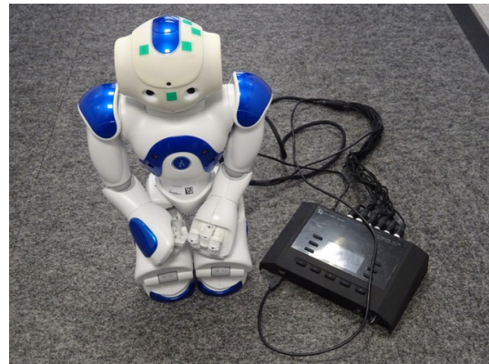
Figure 2. The Popeye+ audio-visual platform (left) delivers high-quality, high-resolution and wide-angle images at 30FPS. The NAO prototype used by PERCEPTION in the EARS STREP project has a twelve-channel spherical microphone array synchronized with a stereo camera pair.