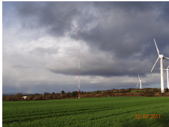
Figure 5. Photo of the met mast after its installation

A meteorological mast has so been installed in March 2017 in Brittany (France) to measure wind on-site. In figure 5 can be seen a photograph of the whole mast after its installation. Figure 6 contains a picture focused on the sensors of the met mast which are wind vanes for the direction and anemometers for the velocity.