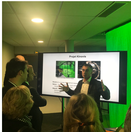
Figure 2. The president Macron's visit of the Kinovis platform in May 2017