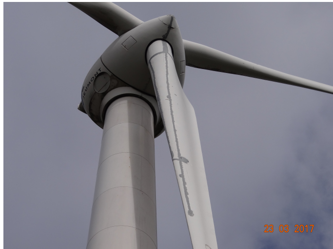
Figure 7. Photo of the pressure side of the wind blade after instrumentation