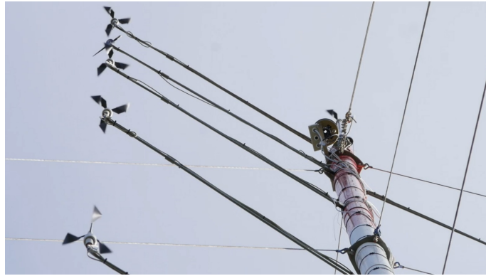
Figure 6. Photo of the sensors on the met mast