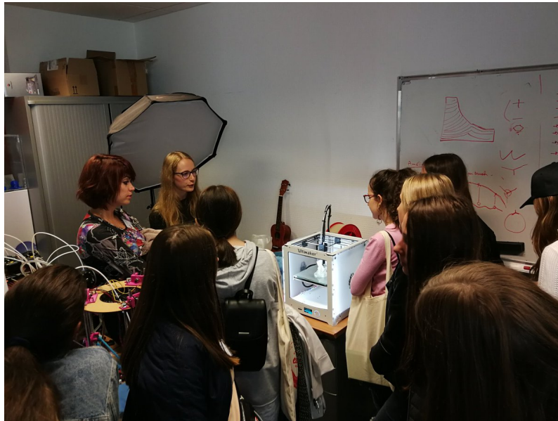
Figure 11. Ada Lovelace Day at MFX Team.