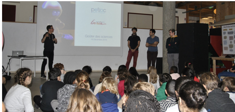
Figure 9. The Potioc team at Gouter des Sciences / les petits débrouillards, Dec. 18.