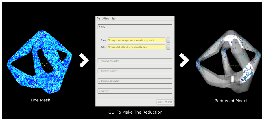
Figure 3. From a computationally intensive simulation to a surrogate version saving accuracy