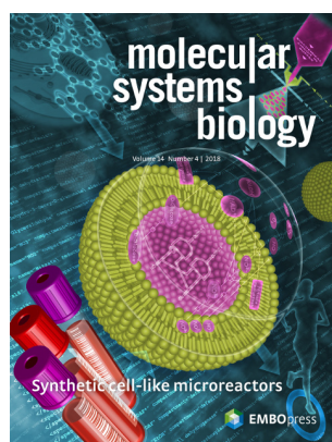
Figure 2. Artistic illustration by Courbet in cover page of Molecular Systems Biology [3].

Researchers at Lab. CNRS-ALCEDIAG Sys2Diag in Montpellier, in collaboration with François Fages, have shown that an algorithm for the differential diagnosis of diabetes can be specified by three Boolean circuits and robustly implemented with real enzymes encapsulated in artificial vesicles that become fluorescent according to 5 different forms of diabetes. The robustness of the circuit was optimized in BIOCHAM by optimizing the initial concentrations of the enzymes with respect to a behavior specification in quantitative temporal logic. The protocells built with a microfluidic device were validated on a cohort of patients' urines from Montpellier's Hospital. Study published in Molecular Systems Biology [3] (see Fig. 2).