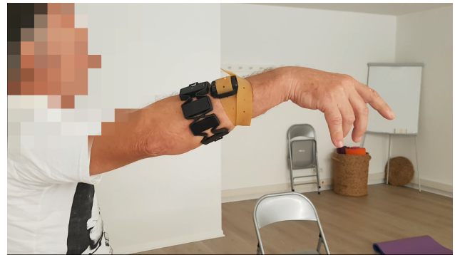
Figure 4. i) Graphical User Interface of the TREMYO Armband monitoring application during acquisition ii) Baseline test with straight extended arm for temporal comparison of the tremors severity.