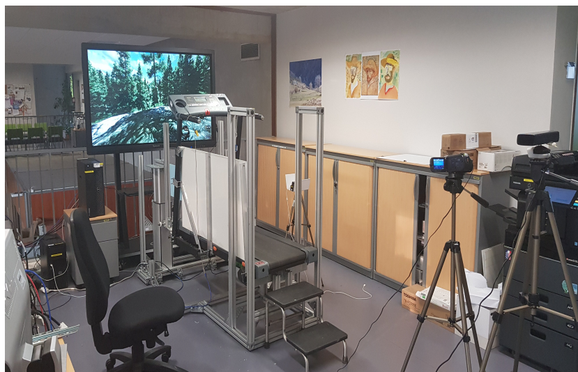
Figure 1. Our rehabilitation station in a configuration with a treadmill, 2 columns for changing its slope and inclination and lidar and kinect for motion analysis

The motion system is composed of two vertical columns whose height may be adjusted (they are used for actuating the treadmill), a 6 d.o.f motion base and a cable-driven parallel robot which may lift the user (in the walking experiment this robot may be used to support partly the user while he is walking allowing frail people to start the rehabilitation earlier). We intend to develop sailing and ski simulators as additional rehabilitation environment. Currently the columns and instrumented treadmill are effective and we have completed at the end of this year the coupling between the subject motion and the 2D visualization of a walk in a nice-looking environment, including basic sound (figure 1 ). Walking analysis is performed using a lidar, a kinect and a distance sensor at the head of the treadmill.