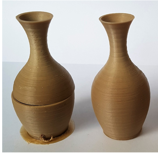
Figure 10. 3D printed vase in PEEK material. Left: Vase breaking during fabrication due to thermal stresses. Right: Adding a thermal shield (not shown) results in a correct 3D print.