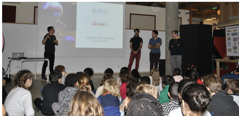
Figure 9. The Potioc team at Gouter des Sciences / les petits débrouillards, Dec. 18.