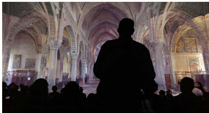
Figure 22. The LSI project in the Ars Electronica center in Linz.