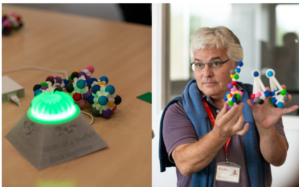
Figure 6. Qui se ressemble s'assemble during the Circuit Scientifique in 2019: (left) classification oracle (right) comparing similar shapes