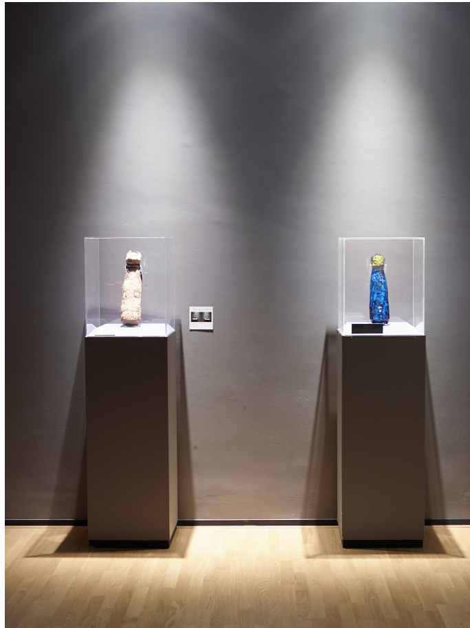
Figure 21. The mummy cat and its copy in the Museum des Beaux-Arts in Rennes.