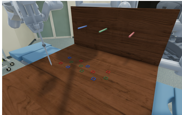
Figure 20. Pick and place exercise using #5 and #7 software